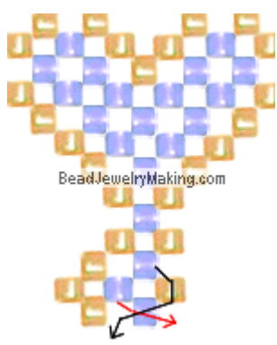
Step 16: After repeating step 13 one more time, work this step with only one side of the string.

• After this you need to repeat step 13 one time.